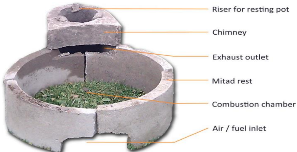
Figure 2: Shows design of Mirt stove

chimney side of the stove can be used for cooking and boiling (e.g. wot, coffee) activities (Dresen, et al. , 2014).